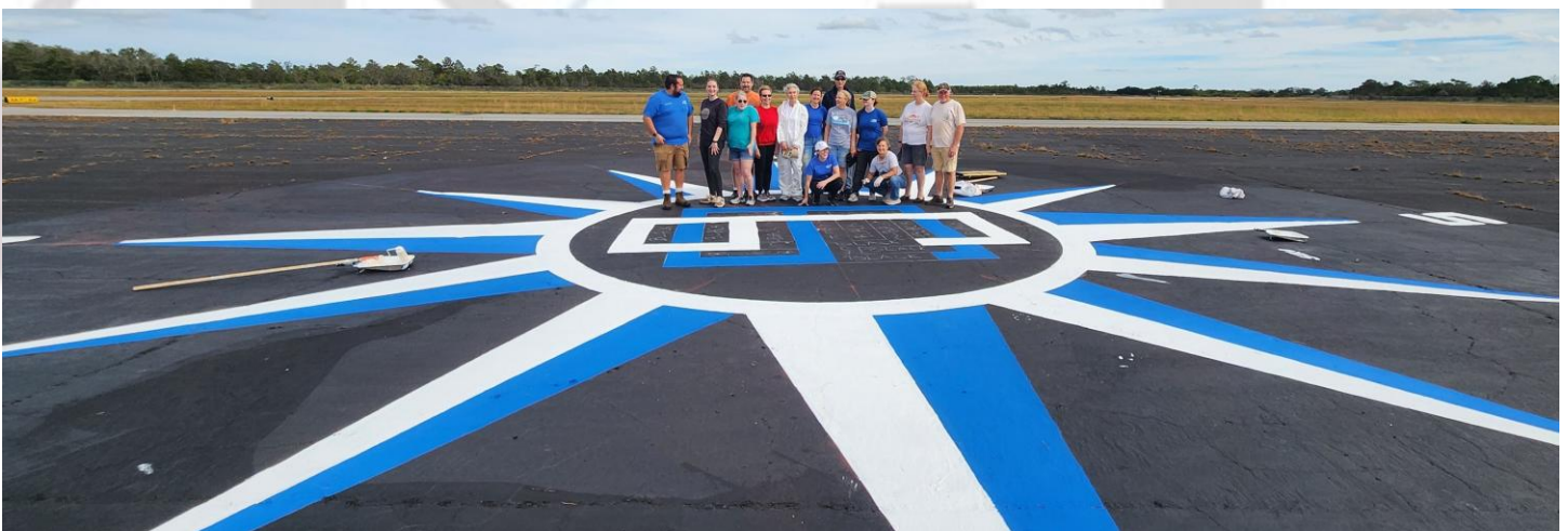
The finished Compass Rose at Valkaria Airport, February 18, 2025