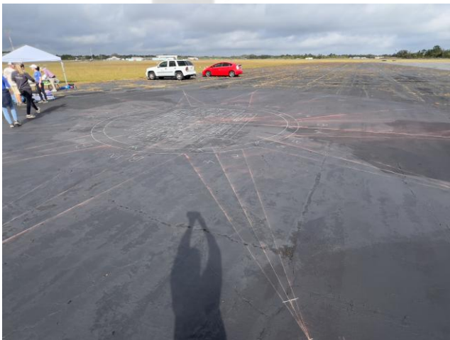
A Rose starts to take shape

I went back to see it on Sunday and it really looks good!