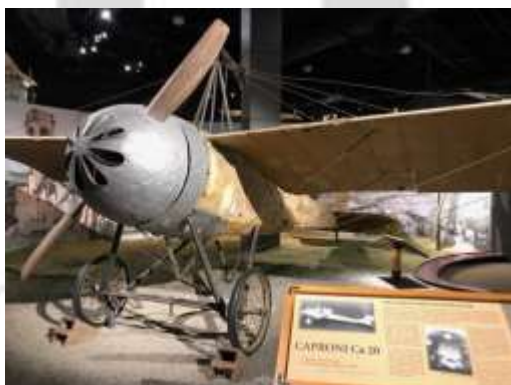
World's first fighter aircraft 1914